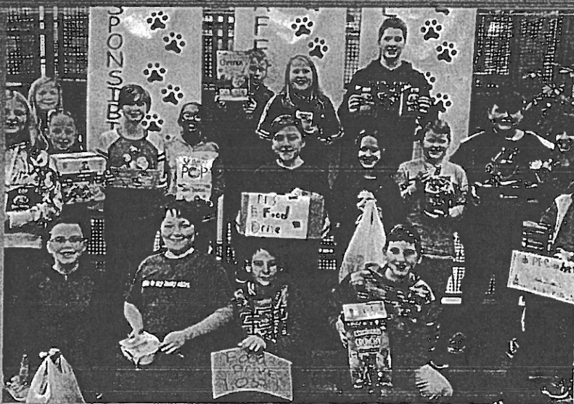
Thank you to everyone who donated to the PES Food Drive. We collected 1,080 items! PMHS is also collecting items through December 18.